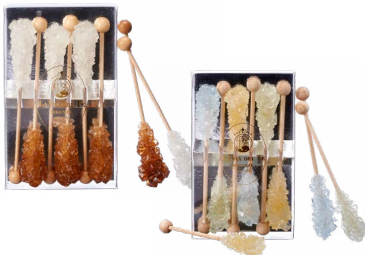
Z21 Sugar cane crystals stick - white and brown (11,5 cm)