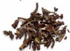
DJ14 Darjeeling Margaret's Hope Second Flush FTGFOP1