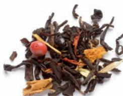
742 Giardino Segreto