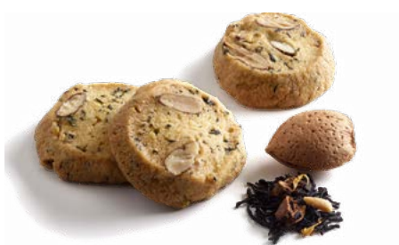
BS29S Il Mistero della Venere tea and almonds