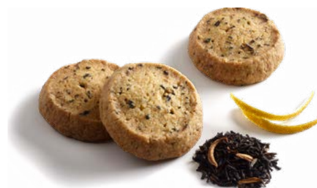
BS28S La Leggenda di Boboli tea and lemon rind