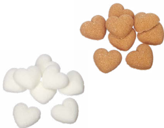
Z19 La Via del Tè heart shaped sugar White, singly wrapped