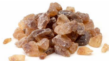
Z5 Sugar crystals Rock