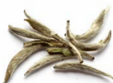
W905 Silvery Pekoe Yin Zhen