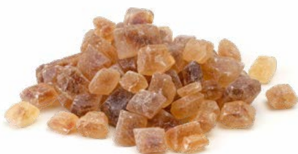
Z6 Sugar crystals Rock cubes Brown