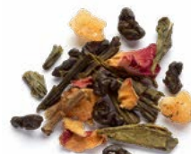
737 Romeo e Giulietta