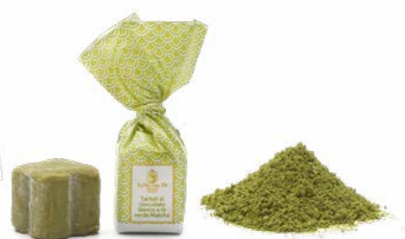
TRF1 White chocolate and Matcha green tea truffles