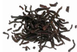
HC1 Ceylon OP1