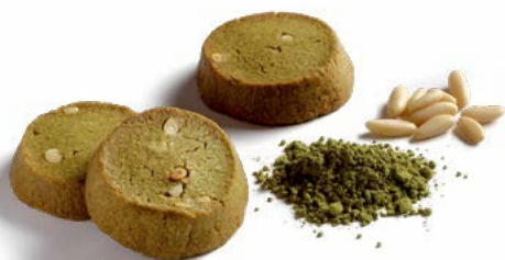
BS25S Matcha tea and pine kernels