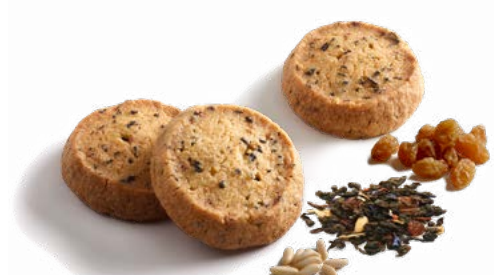
BS30S Il Sogno di Michelangelo tea, raisin and pine kernels