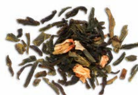
410 Bancha Fiorito