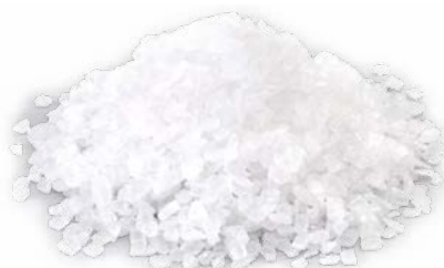
Z4 Sugar crystals White