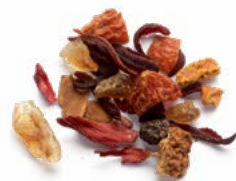
625 Notti in Tibet