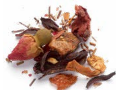
624 Moulin Rouge