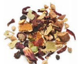
853 Tisana Gym Tonic