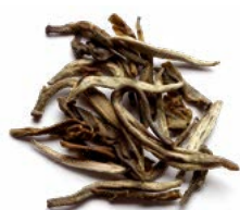
0009 King of Jasmine