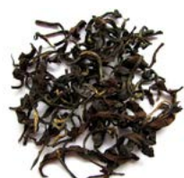
Y001 Oriental Beauty