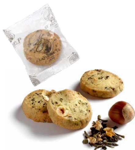
BS22S Bancha Fiorito tea and hazelnuts