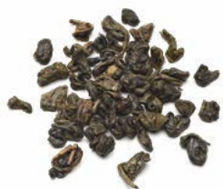
G604 Special Gunpowder