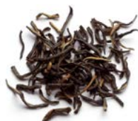
HC7 Grand Jardin GFOP