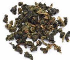
Y007 Tung Ting