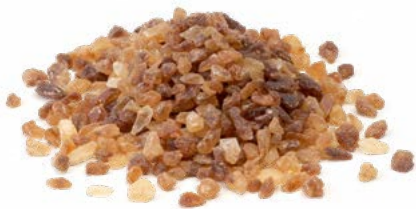
Z3 Sugar crystals Brown

Although some connoisseurs – as British writer George Orwell – love to drink tea strong and plain, adding a pinch of sugar to the drink is a pleasure enhanced by the heart shaped sugar – singly wrapped – and sugar candy in crystals, ideal to sweeten tea without altering its delicate flavour, thanks to its neutral quality.