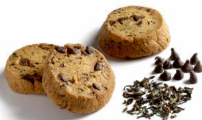
BS23S Earl Grey Imperiale tea and chocolate drops