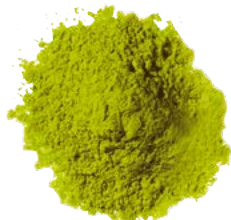
J366/B10 Matcha Tsuru