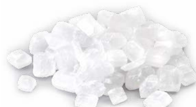
Z18 Sugar crystals Rock cubes White