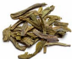
G154 Lung Ching Special