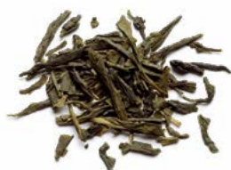
J388 Sencha Special Fine