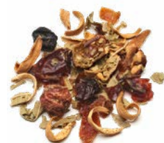
848 Tisana Good Feeling