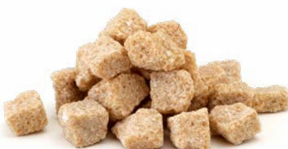
Z7 Cane sugar lumps Brown