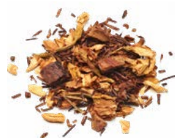
856 Rooibos African Dream